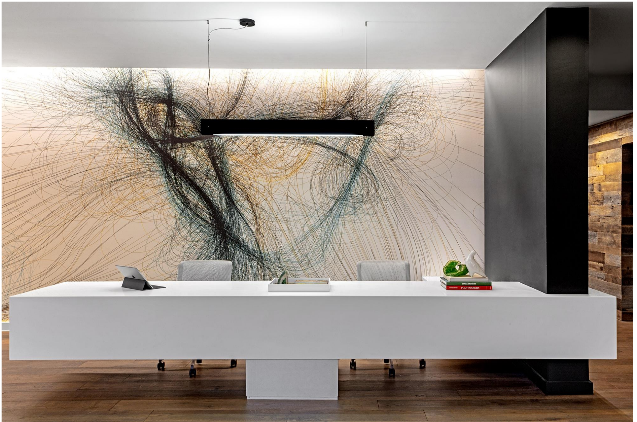
Avenue Grove in Houston, Avenue Grove Houston.

Dancie Perugini Ware Public Relations; a stylish renovation of a mid-century building for Gulf Coast Pavers; and sleek mid-rise and high-rise residential buildings in the Museum District and Upper Kirby, including The Southmore and Avenue Grove.